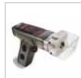
LightRay 100 Series generates off-axis diffuse illumination

Microscan's patented LightRay Optics solution further enhances the MS-Q's ability to read directly marked parts. By directing the illumination toward the symbol at off-axis angles, the LightRay Optics increase symbol contrast and filters out texture noise. The LightRay Optics are designed so that the MS-Q is positioned at the correct focal distance and angle. No training is needed to find the best angles for reading low contrast symbols. Either optical accessory easily attaches onto the end of the MS-Q. Two options are available: the LightRay 100 Series and the LightRay 200 Series.