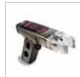
LightRay 200 Series generates dark field illumination