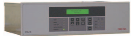
Printer Control Unit PCU III