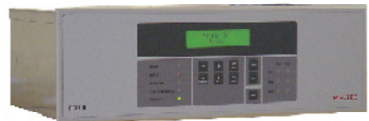
Printer Control Unit PCU III