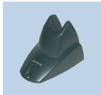
STD Heron™ Hands-Free Stand

Switzerland • OPAL Associates AG • Motorenstrasse 116 • CH-8620 Wetzikon • Telefon +41 (0)1 931 12 22 • Telefax +41 (0)1 931 12 20 • Email info@opal-holding.com • URL http://www.opal.ch/ • OPAL Associates SA • Avenue des Boveresses 54 • Case postale 29 • CH 1000 Lausanne 21 • Telefon +41 (0)21 653 95 00 • Telefax +41 (0)21 653 95 02 • Email info@opal-holding.com • URL http://www.opalsa.ch/ • Germany • OPAL Associates GmbH • Lohnerhofstrasse 2 • D-78467 Konstanz Telefon • +49 (0)7531 813 000 • Telefax +49 (0)7531 813 00 99 • Email info@opal-holding.com • URL http://www.opalgmbh.de/ • OPAL Associates GmbH • Osterholder Allee 2 • 25421 Pinneberg • Telefon +49 (0)4101 787 615 • Telefax +49(0)4101 787 616 • Email info@opal-holding.com • OPAL Solutions GmbH • Karl-Heinz-Beckurts-Str. 13 • 52428 Jülich • Telefon +49 (0)2461 344 954 • Telefax +49(0)2461 343 208 • Email info@opal-holding.com • URL http://www.opal-solutions.de/ • Büro München • Telefon • 089 12737 556 • Telefax 089 12737 557 • Büro Frankfurt • Telefon • 069 8236 6501 • Telefax 69 8236 7709 • Austria • OPAL Associates GesmbH • Vorarlberger Wirtschaftspark • A-6840 Götzis • Telefon +43 (0) 5523 58833 • Telefax +43 (0)5523 521569 • Email info@opal-holding.com • URL http://www.opalgmbh.at/